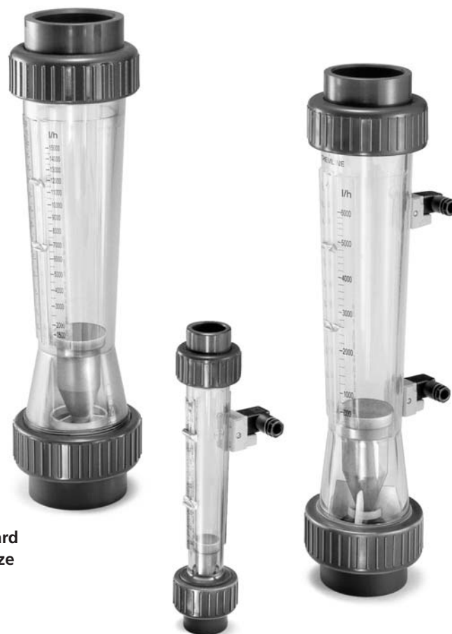
Standard Full Size