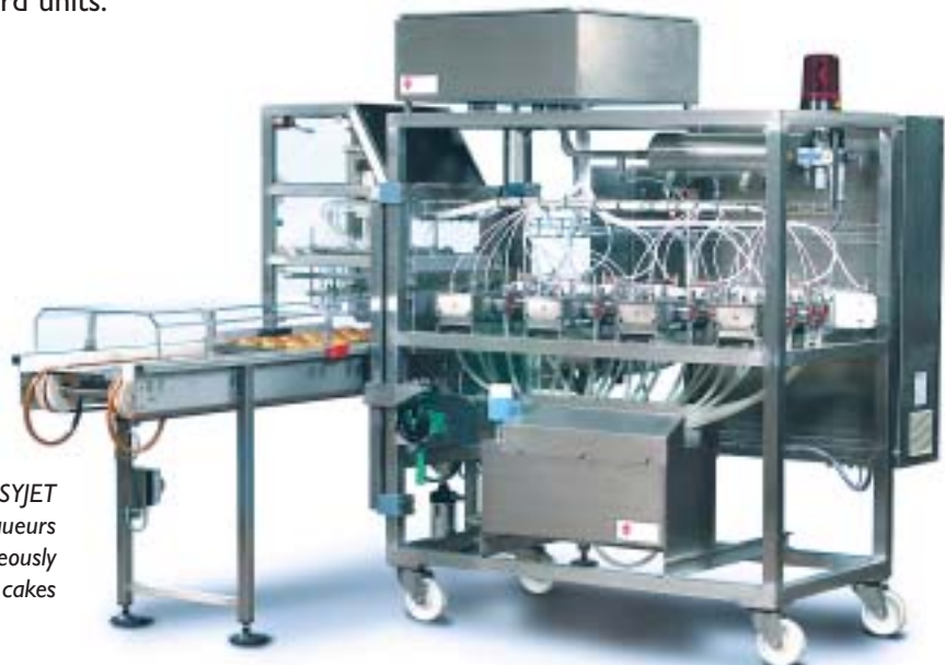
DOSYJET Flavored liqueurs being simultaneously injected into cakes