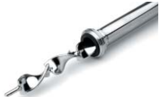
DOSTAM Static in-line mixer