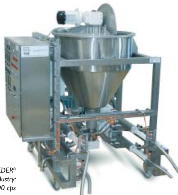
VISCOFEEDER® in the pet food industry: continuous injection dosing at 1,000,000 cps