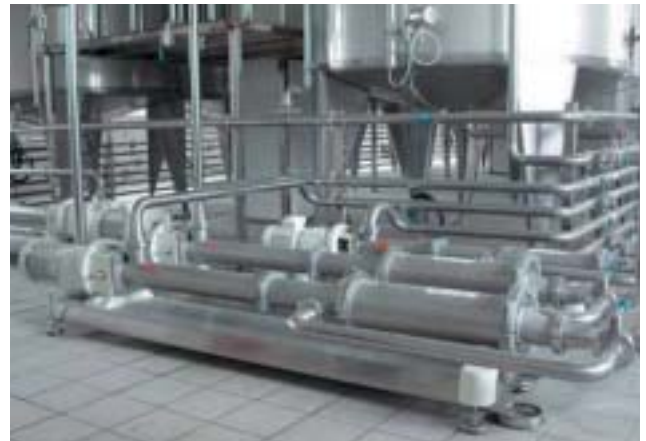
Moineau Series H Pumps with fresh dairy products: Plain bulk yogurt transferred to heat-exchanger and then to packing line