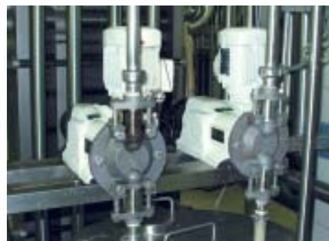
Two Préci Pump Lagoa Series pumps in the dairy industry: pumps with stainless steel body for dosing acid and soda in the Cleaning In Place zone