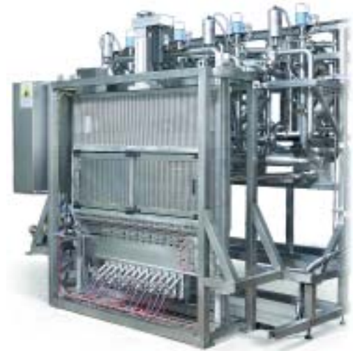
DOSYFILL® Fresh products being filled into pots