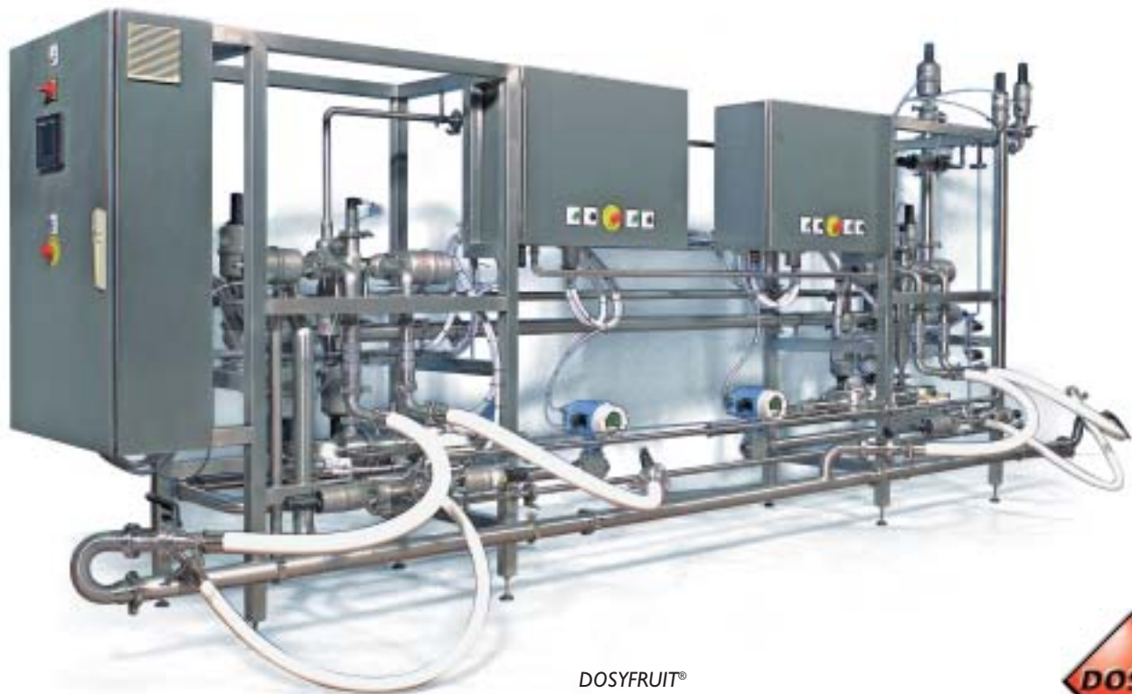
DOSYFRUIT® Fruit injected into stirred yogurt