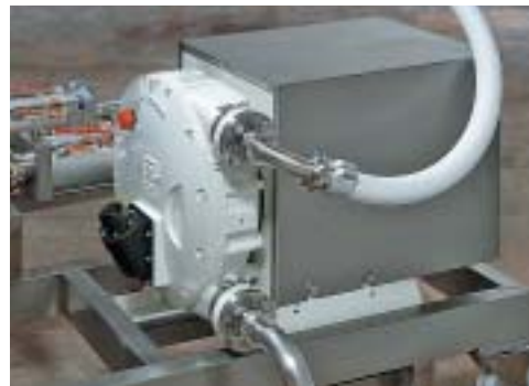
DL Pump in the ready-made meals industry: racking from a mobile tank into hopper of a dosing system supplying the container packing line