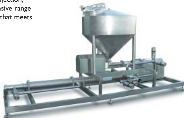
Skid for proportional fruit dosing