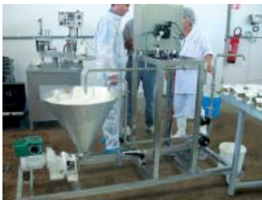
Testing a skid for preparation and dosing of cheese into containers

Preparation and continuous dosing, proportional injection, filling skids... whatever your application, our extensive range and expertise enable us to custom-build a system that meets your specific needs.