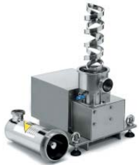
DOSYMIX ® Dynamic in-line mixer