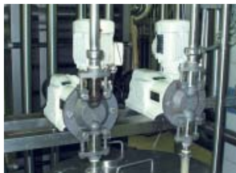
Two Préci Pump Lagoa Series pumps in the dairy industry: pumps with stainless steel body for dosing acid and soda in the Cleaning In Place zone